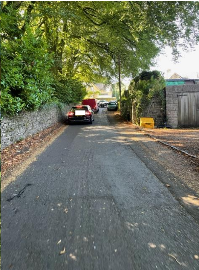
convergence in village from route C into village centre