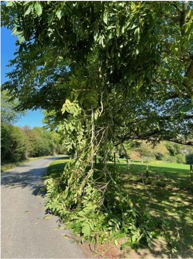
Damage from vans Route E